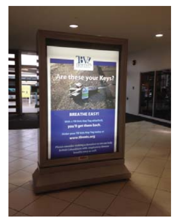
Mall Poster at Park Royal Shopping Centre