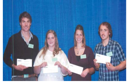
2012 recipients of TB Vet's Bursaries.