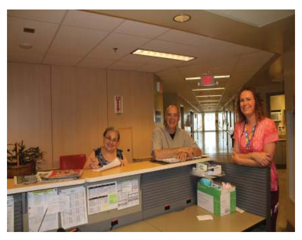
Staff in the TB Ward at VGH

Most of the patients are a threat to the general population, but they can't keep them there against their will. Unfortunately, sometimes some of them leave before they finish their treatment, which can last several months. The main reason for them to leave is boredom.