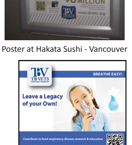
Newspaper Ad for the "Leave a Legacy" issue of The Vancouver Sun