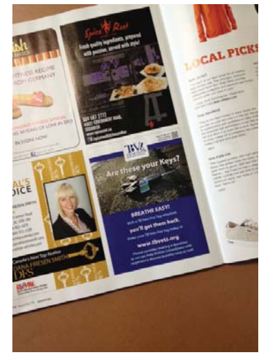
Ad in Mountain Life Magazine