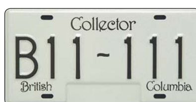
PASSENGER/COMMERCIAL COLLECTOR (RS049)