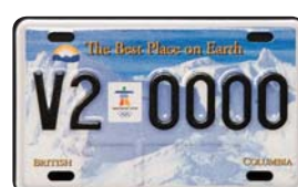
MOTORCYCLE 2010 WINTER GAMES (RS063)