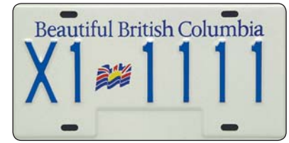
INDUSTRIAL VEHICLE (RS008)