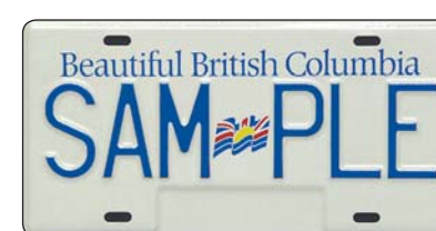
SAMPLE PLATE FOR PLATE COLLECTORS