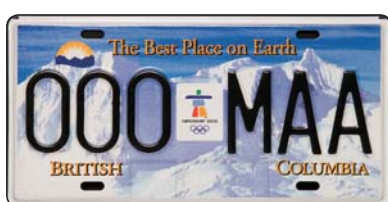
PASSENGER/MOTOR HOME 2010 WINTER GAMES (RS061)