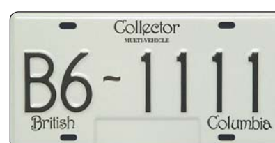
PASSENGER/COMMERCIAL COLLECTOR - MULTI-VEHICLE (RS052)