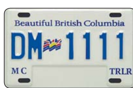
MOTORCYCLE/TRAILER DEMONSTRATION (RS018)