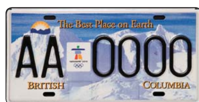
COMMERCIAL TRUCK 2010 WINTER GAMES (RS062)