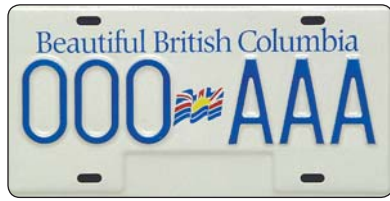
PASSENGER/MOTOR HOME (RS101)