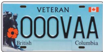
PASSENGER/MOTOR HOME VETERAN (RS057)