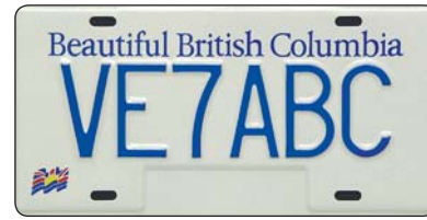
AMATEUR RADIO (RS010)