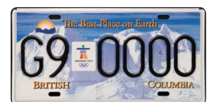
FARM TRUCK 2010 WINTER GAMES (RS066)