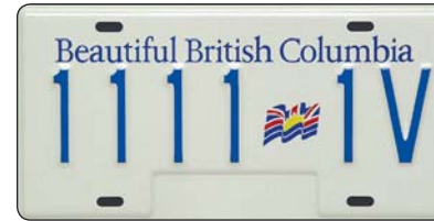
COMMERCIAL TRAILER (RS004)