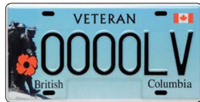
COMMERCIAL TRUCK VETERAN (RS058)