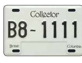
MOTORCYCLE COLLECTOR (RS050)