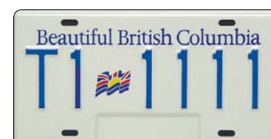
QUARTERLY (LOGGING TRUCK) (RS051)