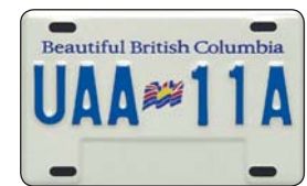
UTILITY TRAILER (RS105)