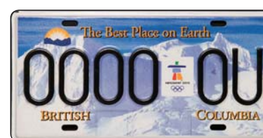
COMMERCIAL TRAILER 2010 WINTER GAMES (RS064)