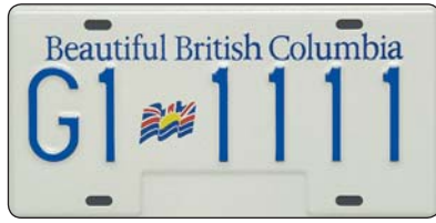
FARM TRUCK (RS006)