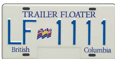
TRAILER FLOATER (RS022)