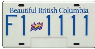
FARM TRACTOR (RS007)